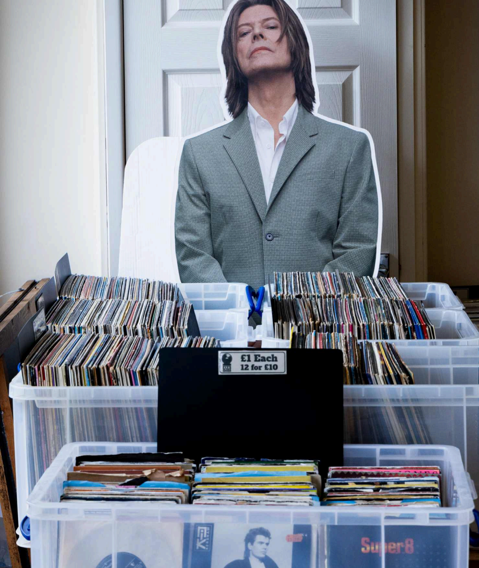
Bowie watching over the racks, trying not to pass judgement on Nik Kershaw fans...