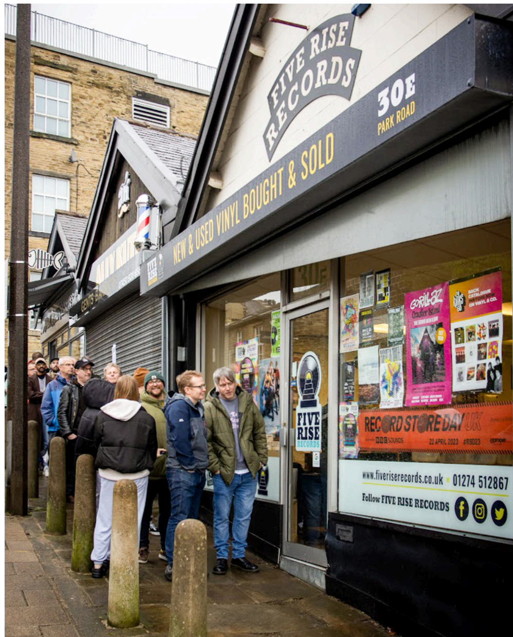
Early morning queue outside on RSD, April 2023